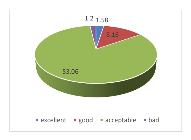
Figure 2: The Quality of Teacher-Learner Rapport in the Department of English Language and Literature of Saida University

The above figure shows that 53.06% of the participated students evaluate their relationship with their teachers as 'acceptable'; 8.16% consider it as 'good'; 1.58% see it as 'excellent'; and 1.2% qualify it as a 'bad relationship'.