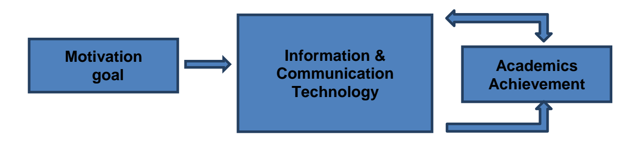
Figure 1.2ICT Academic Staff Developmentmodel.

ICT development plan for academics, lecturers and researchersbest performance so the Libyan higher education sector can have a strong ICT network infrastructure, capable of providing all modern services and accommodating the high data flow resulting from the use of these services and applications, thus supporting a knowledge-based education, and achieving our universities goals of building an information society. In addition, the Libyan Ministry of Higher Education must conduct similar training projects that aim to build adequate ICT infrastructure. And such academic staff training programs should be able to improve the quality and extent of learning among universities by encouraginge-learning and distance education. ICTacademic staff development model (Figure 1.2) was developed during this study, which is designed especially to gain experience about information and communication technology and it's expected to be one of the most frequently cited models of ICT interaction training programs in Libya, it posits that ICT effectiveness may increase in the light of the reactions of Libyan academic staff strategic improvement.